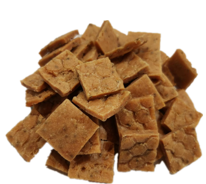
salmon & chia seed bits