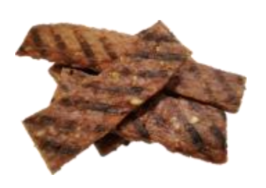
whole chicken meat fillet