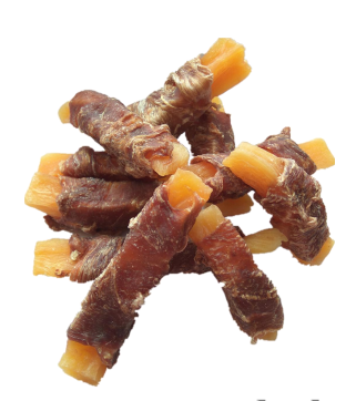
sweet potato duck