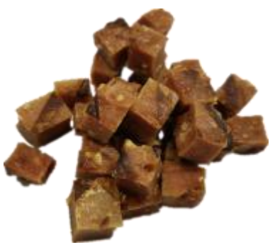
whole chicken meat mini cube