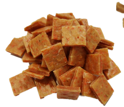
chicken & carrot bites