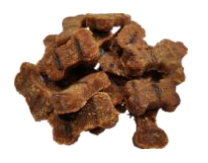
bone shape beef