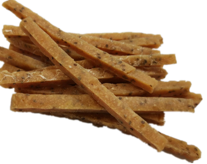
chicken & chia seed sticks