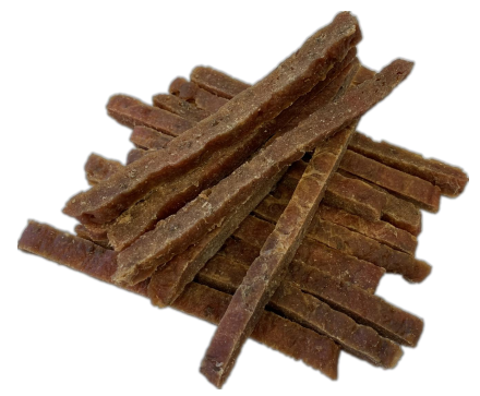
Lamb& chia seed sticks