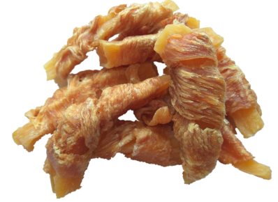
sweet potato chicken