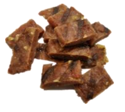
whole chicken meat bite